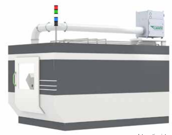
Integration into machine tools