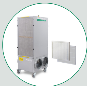
UPGRADE PRE-FILTER TO 97MM ECOPLEAT