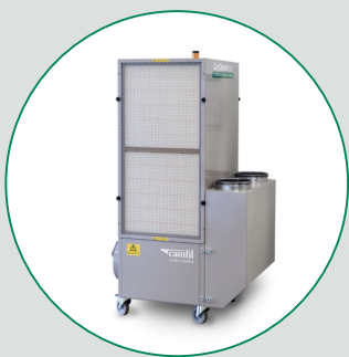
SILENCER (ONLY FOR VERTICAL MODEL), 1-2 PCS PER UNIT