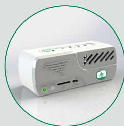
AIR IMAGE SENSOR