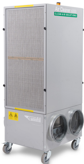
Air Cleaner CC 6000 Vertical

Air Cleaner CC 6000 is engineered to help large logistic and manufacturing companies keep employees healthy, improve product quality and reduce dust.