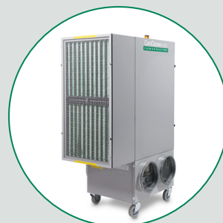
EXT. FRAME FOR BAGFILTER/CITYCARB/CITY-FLO 592X592X MAX 370 (WITHOUT FILTER)