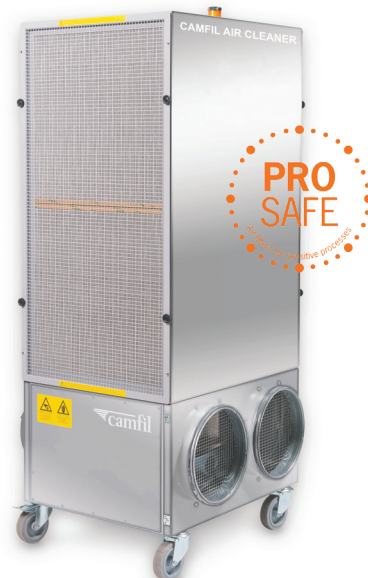
Air Cleaner CC 6000 Prosafe