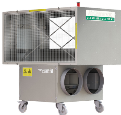
Air Cleaner CC 6000 Horizontal