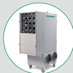
MOLECULAR BOX FOR 2X32 PCS CAMCARB CG 1300 INCL. 2 FRAMES (WITHOUT FILTER), 2 PCS PER UNIT