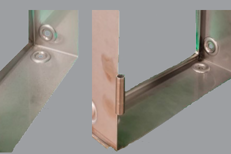
Gaskets seal against flange on MagnaFrame II