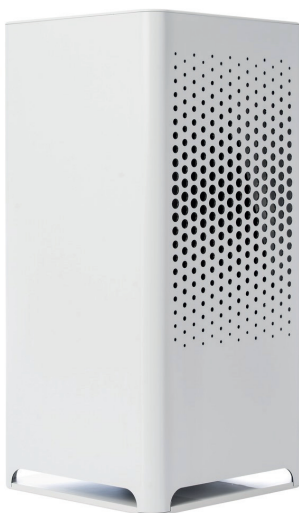
Air Purifier City M