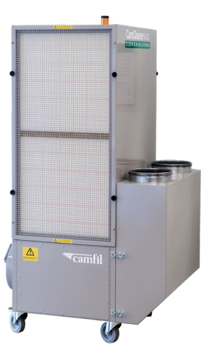
Air Purifier CC 6000

In order to measure the power and ensure that the air is actually of the quality it should, an Air Image was also installed in each room - Camfil's own air quality sensor. Air Image measures the particles in the air and presents air quality in a clear and simple way.